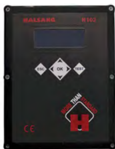
Electrical cabinet with Halsang H102 control unit and frequency modulators