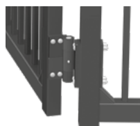
Hinges, can withstand a load of 400 kg