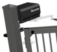
Motor and gearbox in high quality.

Lubricated ball bearing hinges ensure a durable and safe operation. When the gate is fully opened, the gate wings are positioned in line with the post and are protected from damage by passing vehicles. As a result, the passage width is optimised. The powerful gate motor with stainless steel and powder coated cover is installed at the top of each post. The intelligent controller (H102) offers numerous programming options, as well as additional access control options.