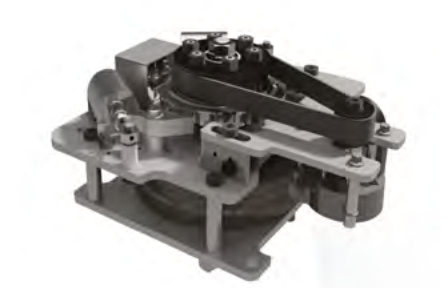
Turnstile mechanism – high standard brake with short response time.