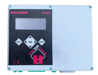
Electrical cabinet equipped with a Halsang H104 controller and frequency modulators

We reserve the right to make any changes to technical specifications due to product development and/or to meet governmental requirements. © Halsängs Stängsel AB • Sweden • 2019