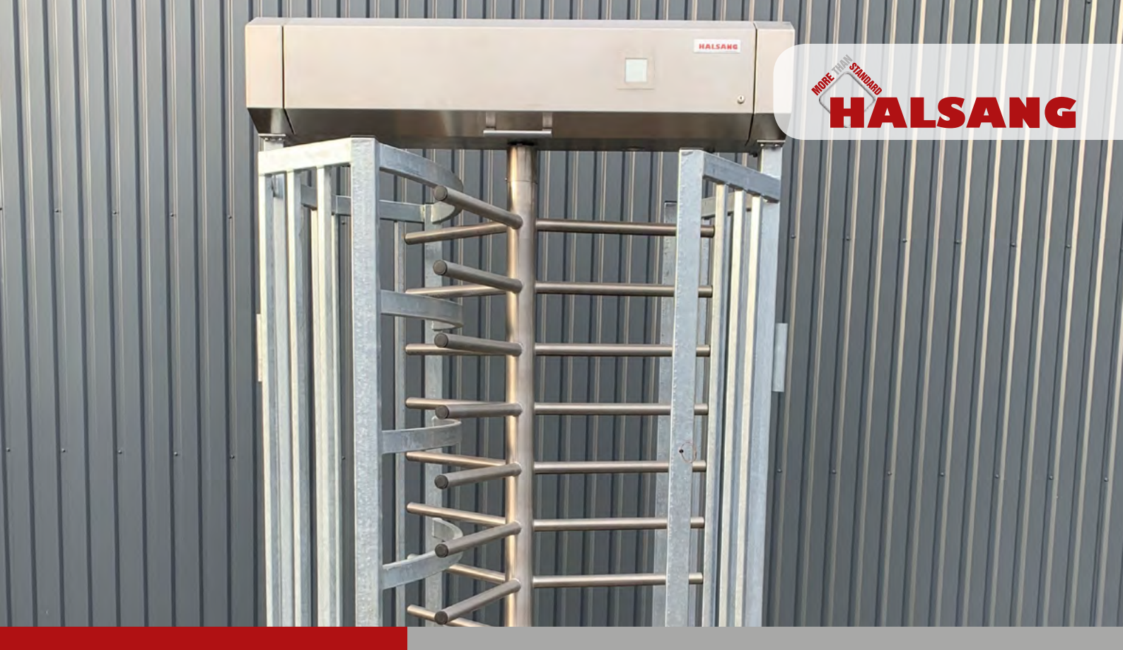
BUILDING SITES • EVENTS • TEMPORARY SOLUTIONS